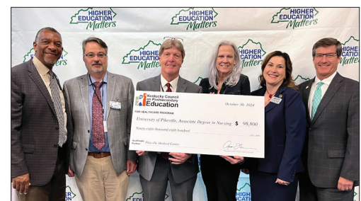
University of Pikeville: $98,000 with Pikeville Medical Center for nursing