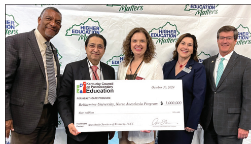
Bellarmine University: $1 million with Anesthesia Services of Kentucky for nurse anesthesia