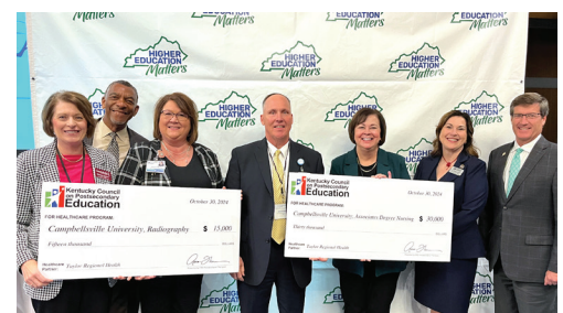
Campbellsville University: $45,000 with Taylor Regional Health $30,000 for nursing $15,000 for radiography