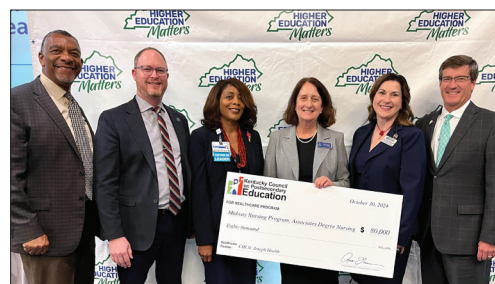
Midway University: $80,000 with CHI Saint Joseph Health for nursing